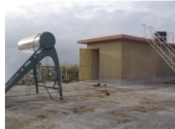
Promoting Solar Water Heating System at Barind Area