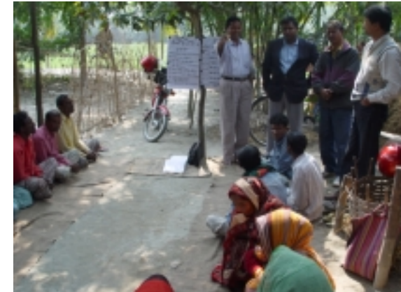
Conducted Beneficiaries Skill Development Training Programme on how to overcome the seasonal crisis period at Monga Prone Area