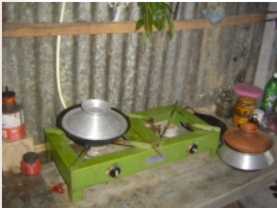
Promoting Biogas at Maona, Gazipur and Jessore area