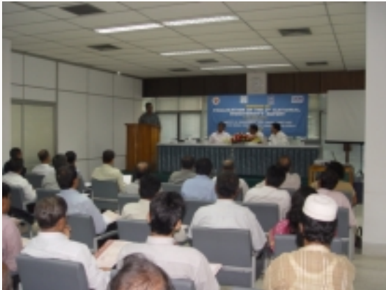
Facilitated to finalize the 3 rd National Report on CBD