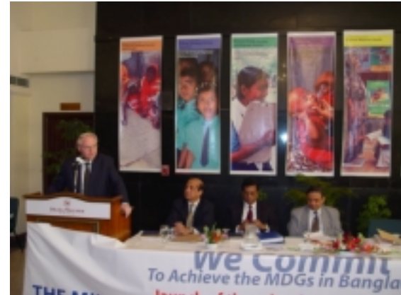
Launching the national report on the MDGs