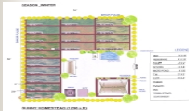
Replicable Model Developed