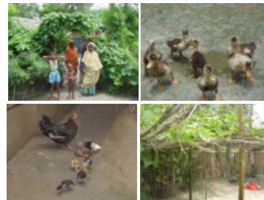
Homestead Gardening & Poultry rearing