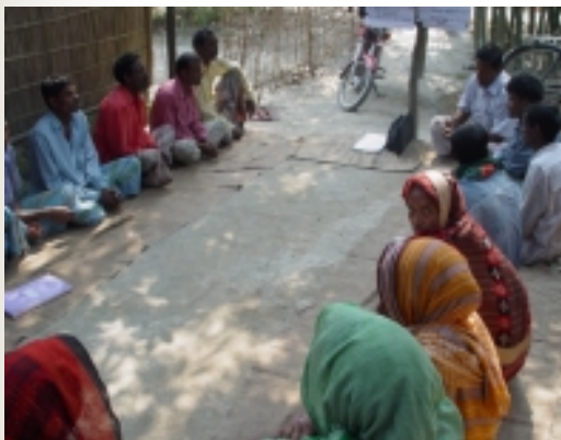
Beneficiaries skill developed