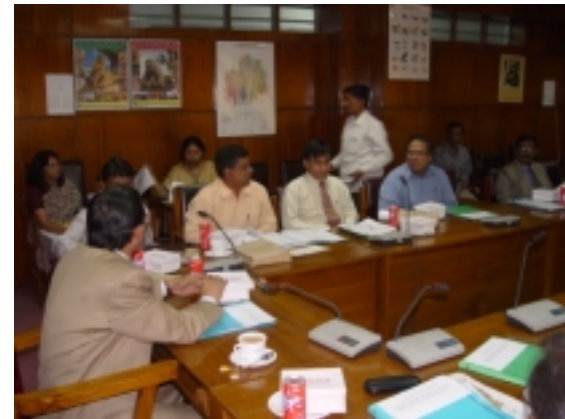
Incorporation of Ecotourism into the National Tourism Policy