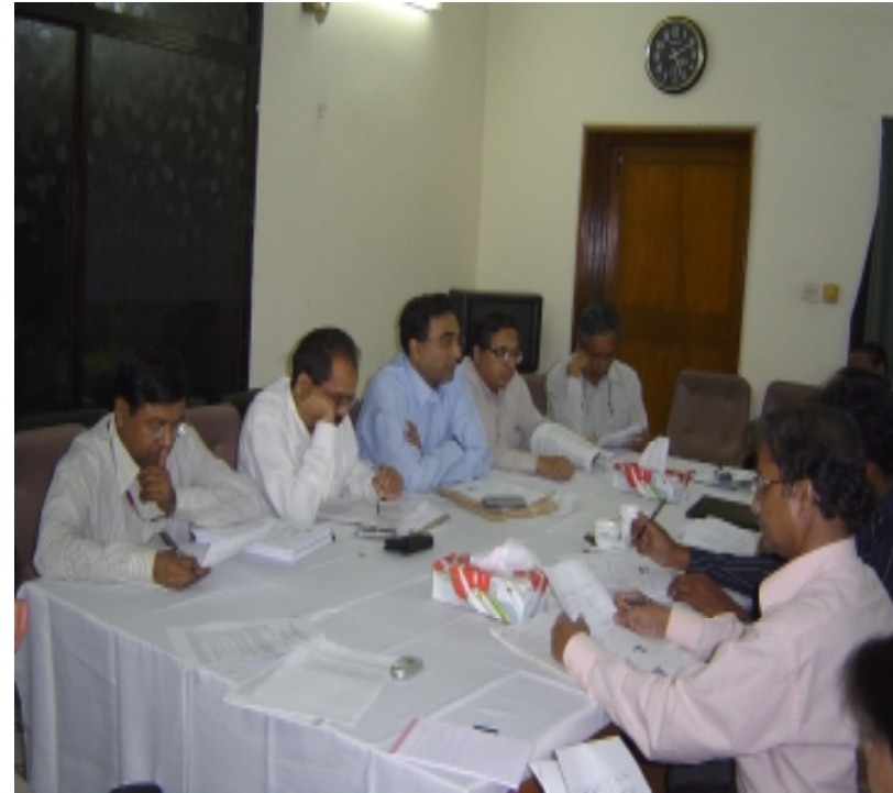
Facilitated MoEF regarding Convention on Biological Diversity (CBD)