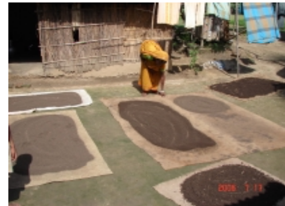
Promoting vermi-compost as a environment friendly technology