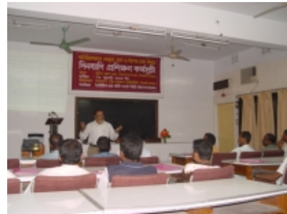
Conducted a Training Program on Date Palm and Palm Tree