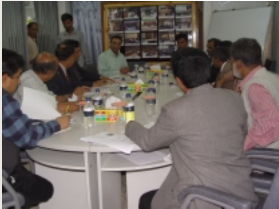
Conducted Research Committee Meeting on Promotion of Bio-diesel in Bangladesh