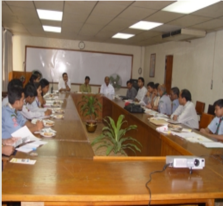
Conducted meeting with Bangladesh Scout about Environmental Issues