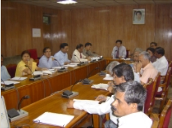
Facilitated to Review and Update the National Energy Policy, 2006