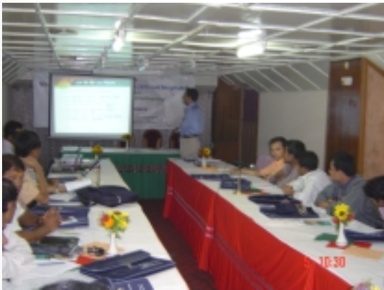
Sensitization on MDGs to the Journalist