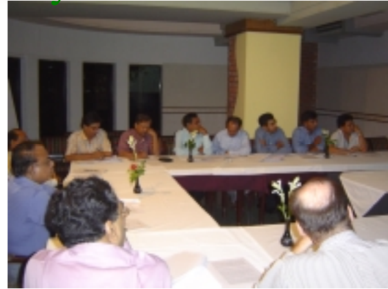
Prepared Draft Wildlife Conservation Policy, 2005