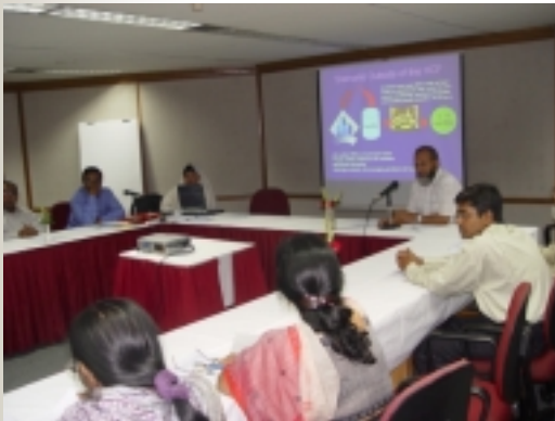
Formulation of Medical Waste Management & Handling Rules and Regulation