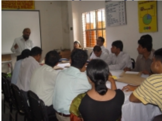
Training Program on Bamboo Propagation through Kanchi Kalam