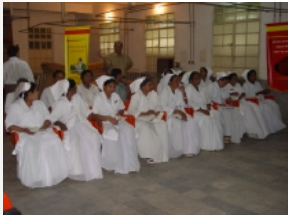
Facilitated Training Programme on Medical Waste Management at Rajshahi City Corporation Area