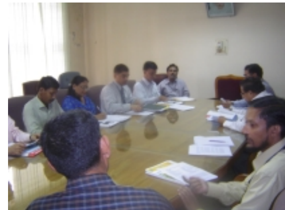
Facilitated to prepare the NAPA project under UNFCCC